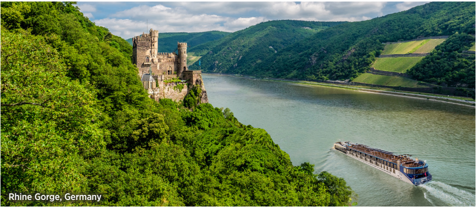
Rhine Gorge, Germany