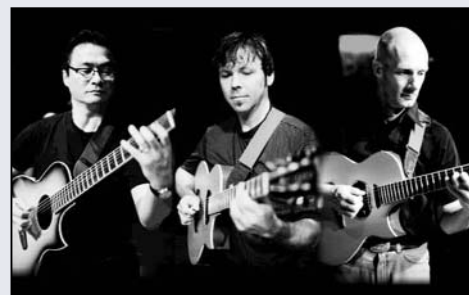
California Guitar Trio

The California Symphony is proud of its reputation as a springboard for young artists and composers, so what better way to open the 20th season than with prodigies.