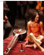
Anoushka Shankar takes her place next to her sitar on a...